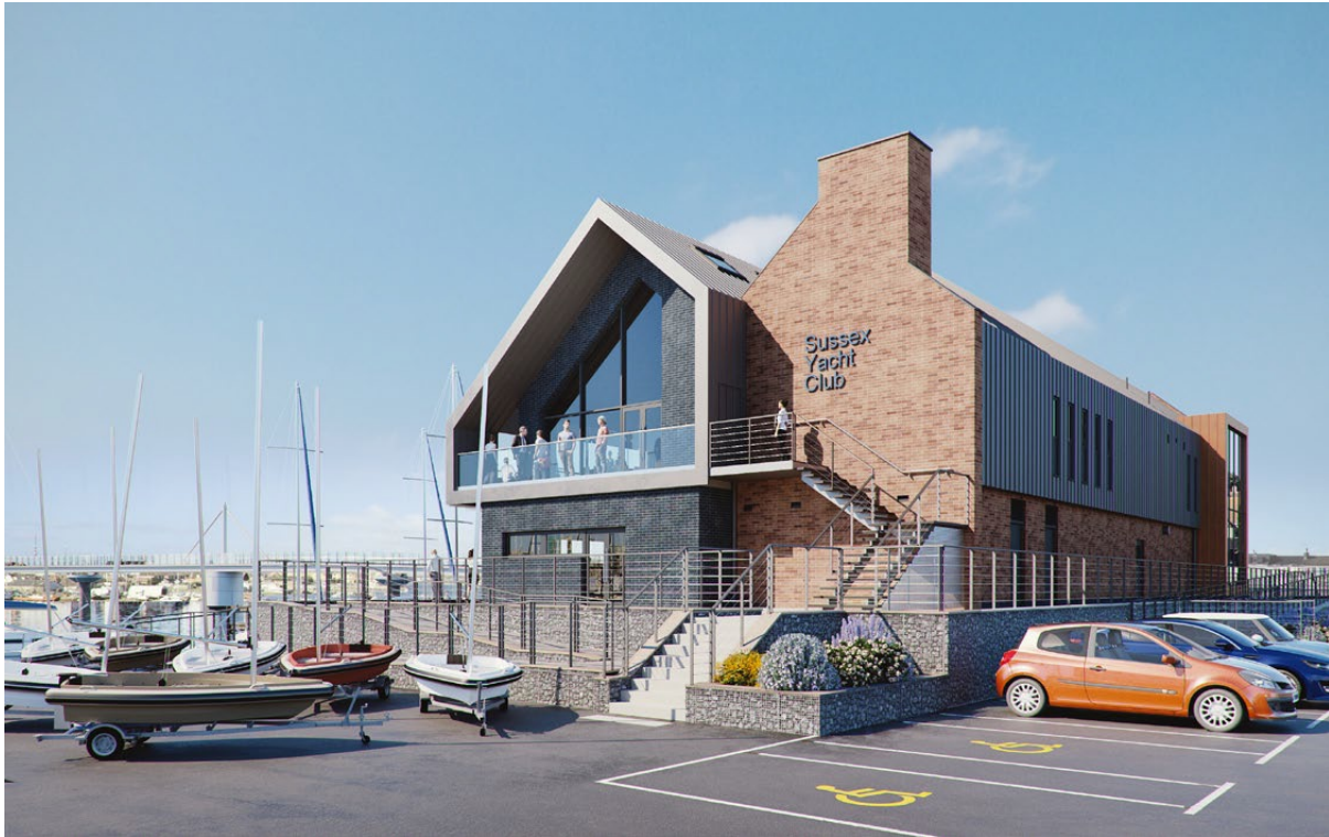
View from Brighton Road