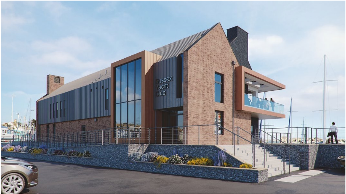
View from Entrance Approach