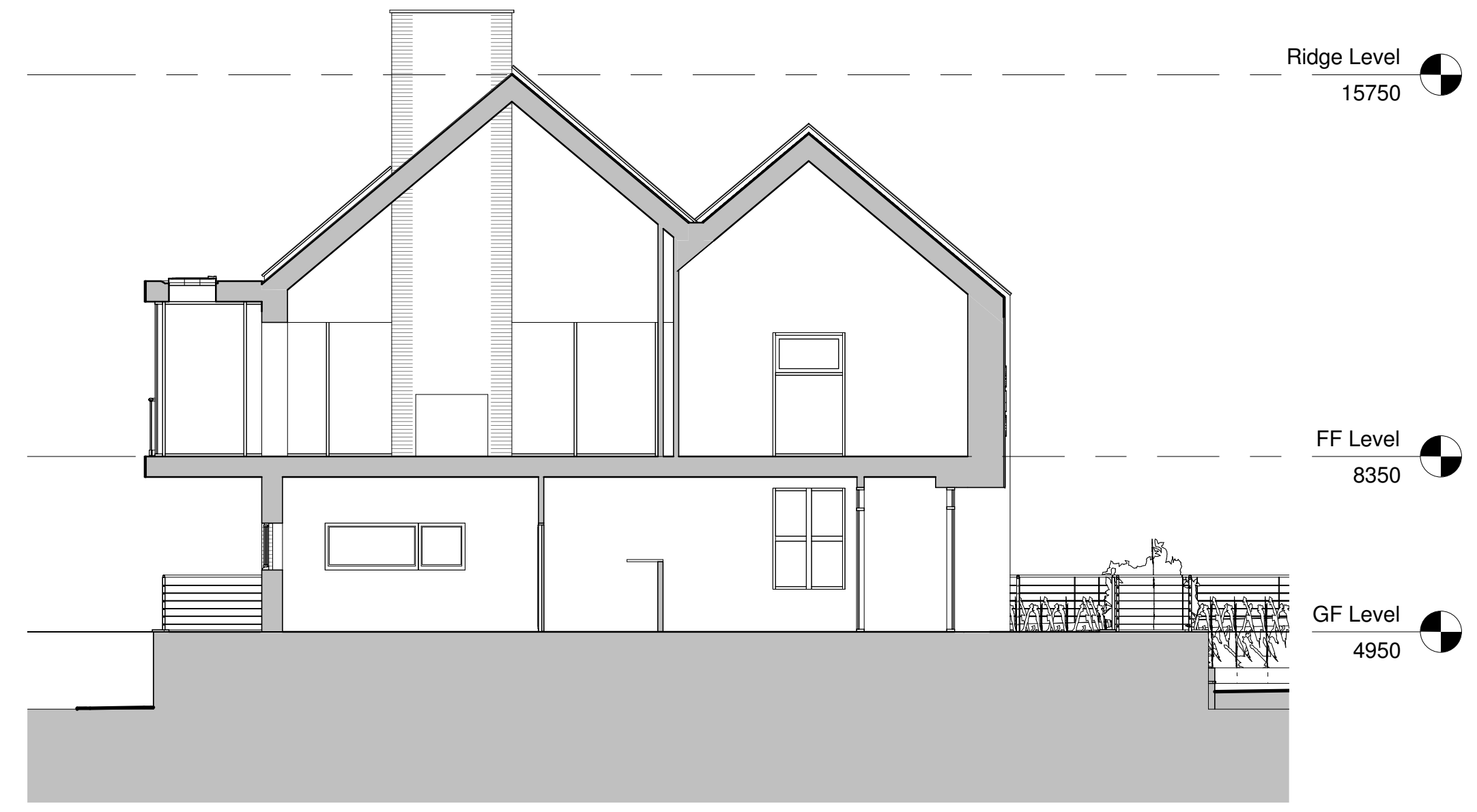
1 Section 1 - Through Conservatory 1 : 100