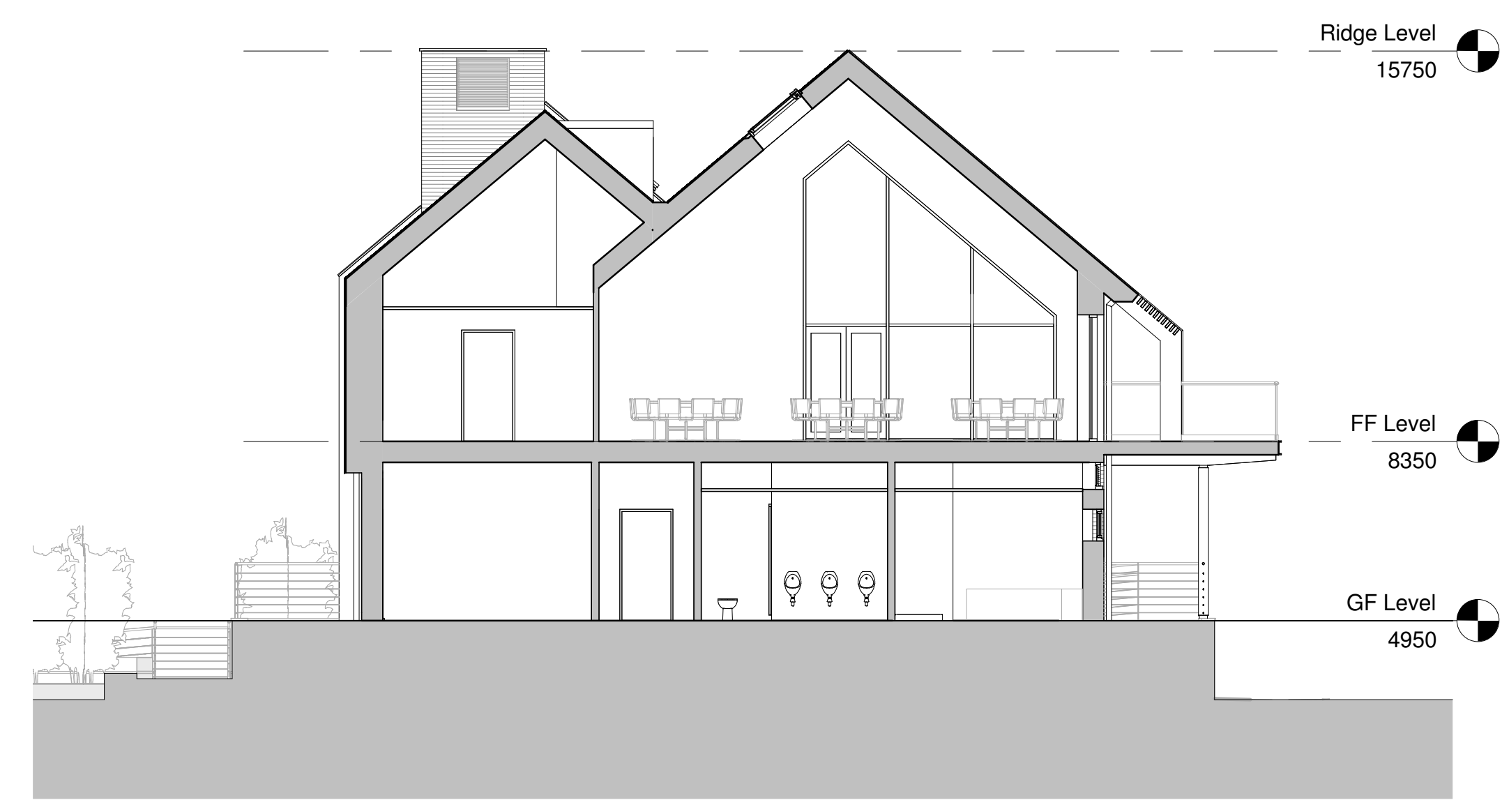
3 Section 3 - Through Dining Hall 1 : 100